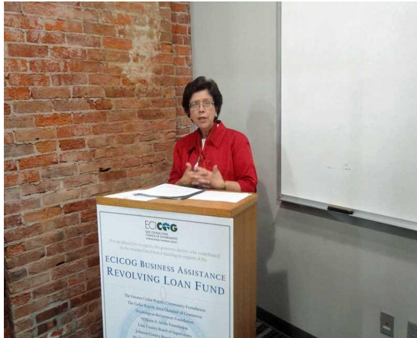
Acting Secretary of Commerce, Dr. Rebecca Blank, announces an award of $2.9 million to ECICOG at the offices of Ovation Networks, Inc. in Cedar Rapids (August 2011)

A variety of contributors committed to provide new matching funds for the RLFs recapitalization. The list of contributors providing the match represents all sectors of the economy and all corners of the region, as well as statewide partners. It includes individual investments from $2,500 to $45,000, and is a testimony to the shared investment in the region's economic vitality.