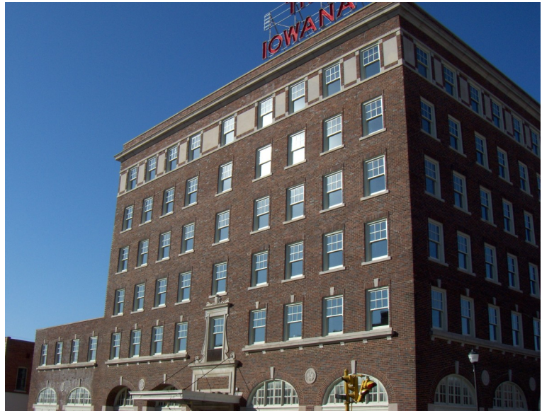
The renovated Iowana building will become a senior housing facility in Creston. SICOG has assisted in the development of this project since its inception several years ago.

The ground floor of the building will include commons areas and possible retail and/or office space. Now included on the National Register of Historic Places, the building continues to hold to the original design of the once popular hotel and anchors a continued local effort to revitalize downtown Creston.