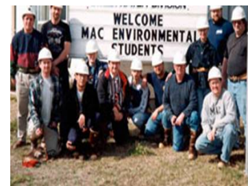
Various COGs provide workforce assistance to their region