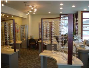
Vision Health Care, Inc. of Dubuque, received a $386,000 loan through ECIA

Traditionally Iowa's COGs were involved in housing either as administrators of regional housing authorities (RHA) or as operators of rehabilitation programs. But as interest in issues facing Iowa's housing stock increased in the 1990s, so did the involvement of its councils of governments.