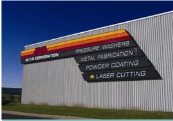
ECIA assisted Mi-T-M Corp. of Peosta, with a $4,000,000 Loan

Through its subsidiary E.C.I.A. Business Growth, Inc., ECIA set a record in assistance to local businesses in 2007. With the approval of $1.9 million in EDA loans, ECIA Business Growth expanded the total funded loans to $6.6 million . Current programs include: