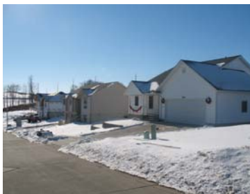
Region XII is completing three Speculative Homes in Conjunction with DMACC

To the extent possible, Region XII COG loans the funds at low interest rates. Repayments are revolved to new beneficiaries each year,