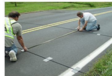
Numerous COGs provide traffic counting services for their member cities and counties

PROMISE JOBS is jointly administered with ECIA and Iowa Workforce Development, and is Iowa's "Welfare Reform" program funded by the Department of Human Services and co-administered by Iowa Workforce Development and the WIA Service Providers statewide. Current Iowa legislation limits cash welfare benefits for families to a maximum lifetime limit of 60 months. PROMISE JOBS assists welfare recipients in the development and implementation of an individualized plan for achieving self-sufficiency.